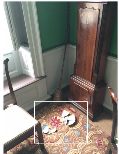
Broken pottery in parlor.