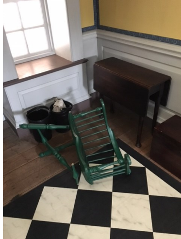
Broken Windsor chair in lower passage.