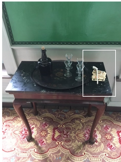
Cards and pipe in parlor.