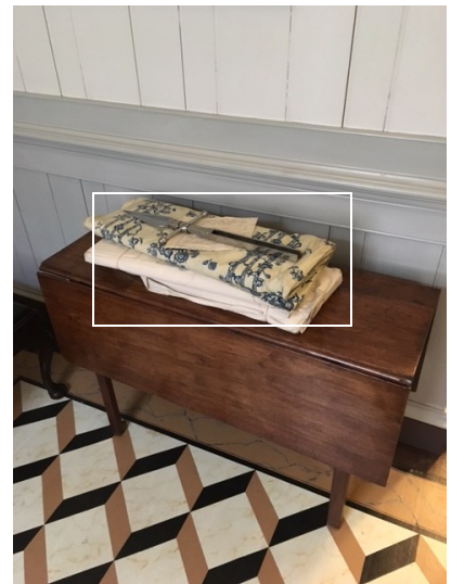
Pole weaponry in study.