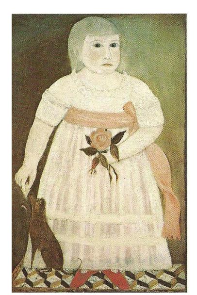
Anonymous Folk Painting, c. Britis 1800. Abby Aldrich Rockefeller 1750 Folk Art Museum.

and in 1710, Captain Hoskin makes a payment for a painted cloth imitating black and white marble.